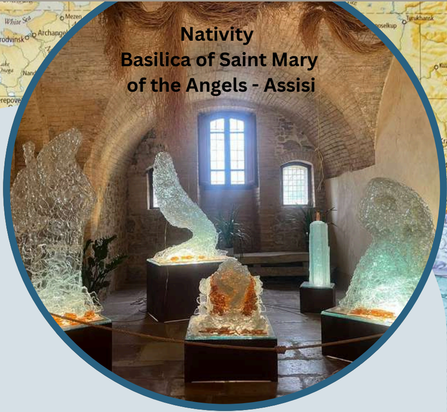
Nativity Basilica of Saint Mary of the Angels - Assisi