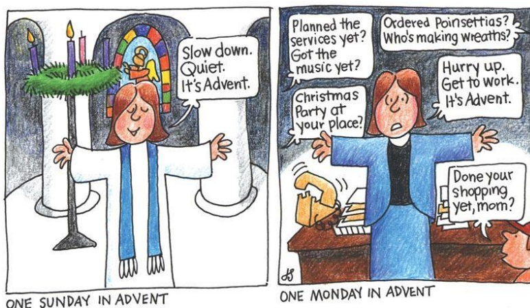
ONE SUNDAY IN ADVENT